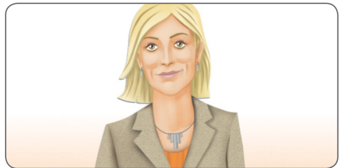
Executives protect the business with a solution they can trust